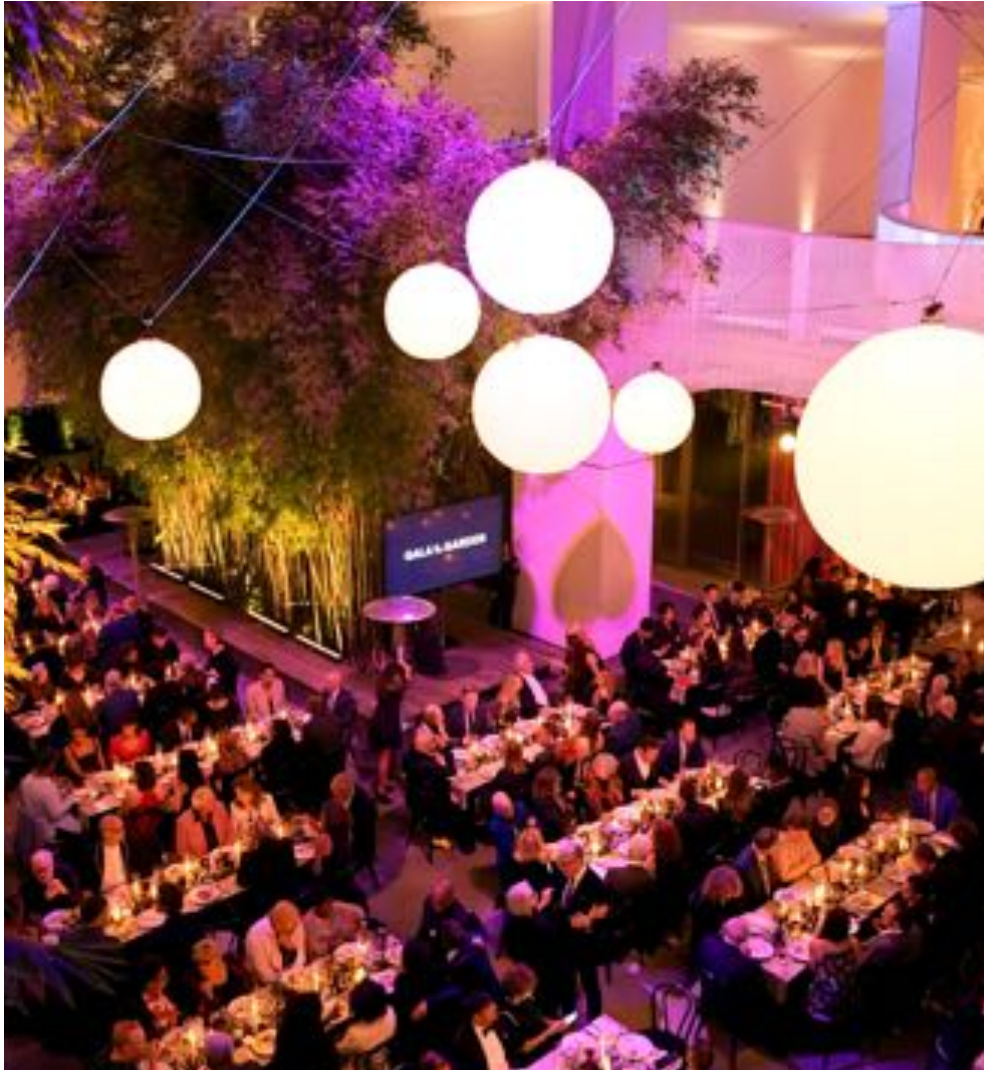
Hammer Museum Gala in the Garden