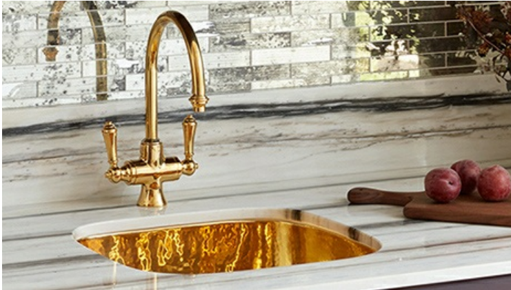
Waterworks taps desire