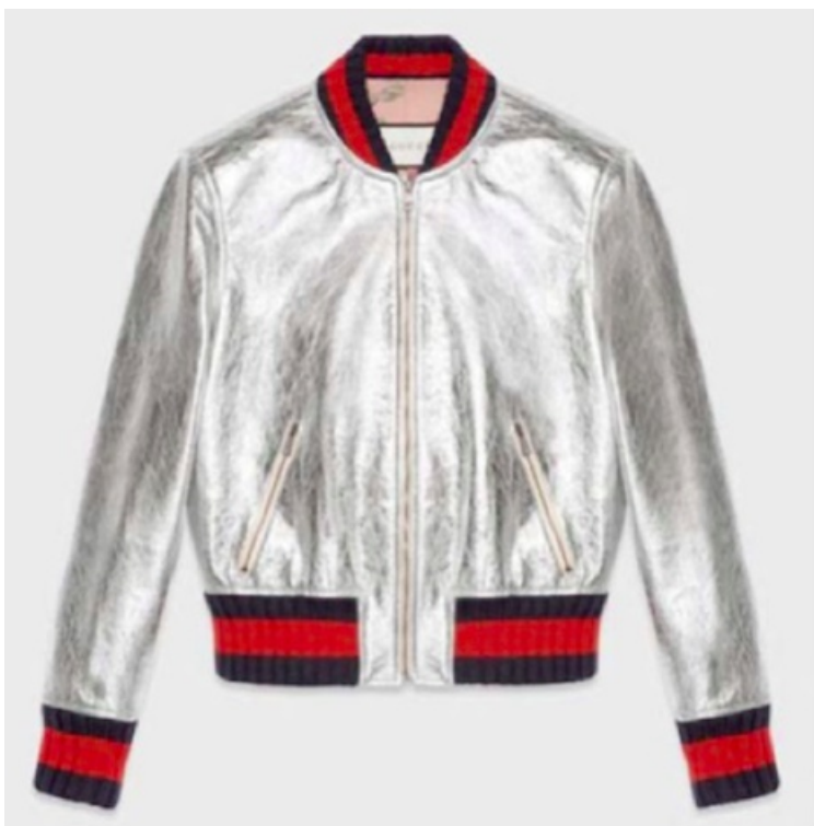
Gucci jacket with blue-red-blue stripe

"ENFORCE IT OR LOSE IT" is the takeaway here. Trademark owners who wish to keep their rights in their marks need to vigilantly police the market and make sure that their marks do not lose their source-identifying power through widespread use.