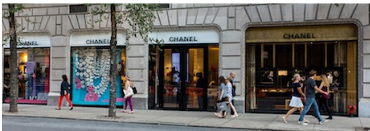
Chanel store on Madison Avenue in New York.

Rather than sprinting from one attraction to another, Chinese visitors can combine in an afternoon visits to cultural touchstones such as The Metropolitan Museum and the Frick Collection with all the stores they know already including Herms, Chanel, Coach and Prada, plus hundreds of independent stores and galleries on Madison Avenue that have been there for generations.