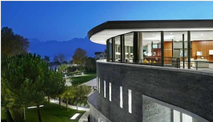
The spa building at Clinique La Prairie in Verbier, Switzerland.